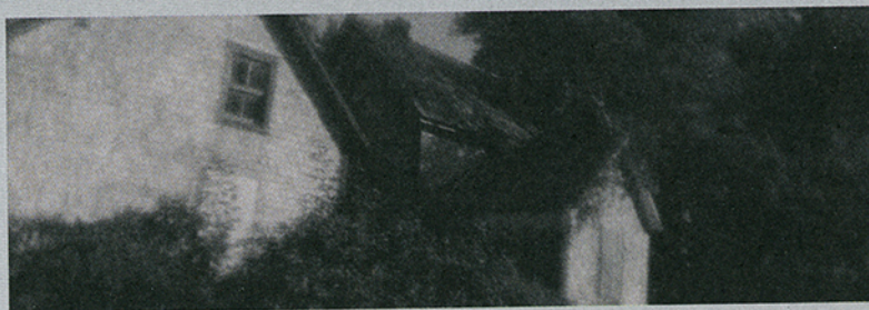
Chesterville n° 6, 2018; Maison 1 Escuminac, 2018, from the series L'éclaircie